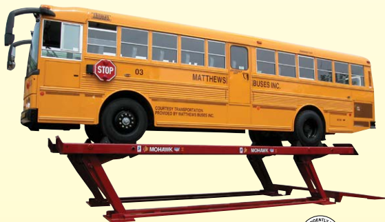
Model 50-26 S