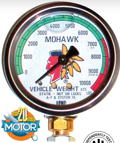
Shown: System IA Accessory #601-440-018