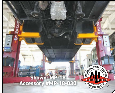
Shown: MP-18 Accessory #MP-18-030