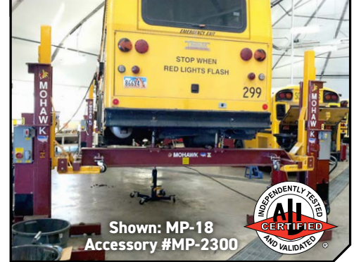
Shown: MP-18 Accessory #MP-2300