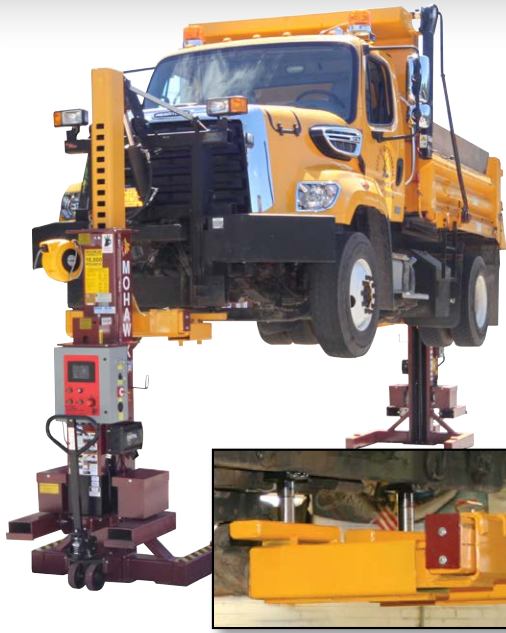
Shown: MP-18 Accessory #MP-2500