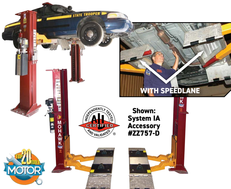
Shown: System IA Accessory #ZZ757-D