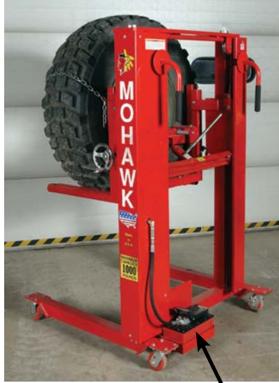
Air / Hydraulic Foot Pump