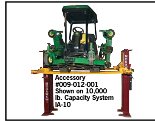
Accessory #009-012-001 Shown on 10,000 lb. Capacity System IA-10