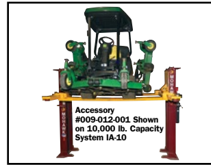
Accessory #009-012-001. Shown on 10,000 lb. Capacity System IA-10