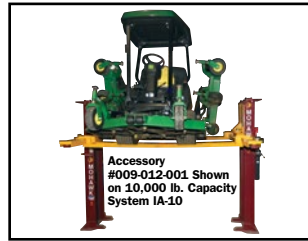
Accessory #009-012-001 Shown on 10,000 lb. Capacity System IA-10