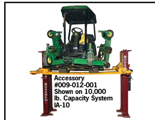
Accessory #009-012-001 Shown on 10,000 lb. Capacity System IA-10