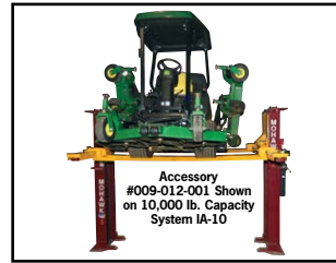
Accessory #009-012-001 Shown on 10,000 lb. Capacity System IA-10