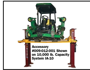
Accessory #009-012-001. Shown on 10,000 lb. Capacity System IA-10