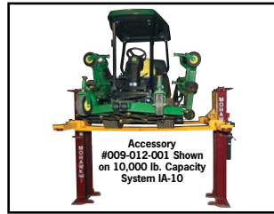
Accessory #009-012-001 Shown on 10,000 lb. Capacity System IA-10