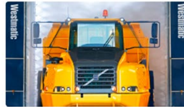
TOUCHLESS SYSTEMS ↻