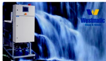
WATER TREATMENT ↻