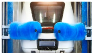
TRAIN WASH ↻