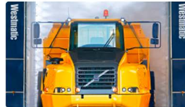
TOUCHLESS SYSTEMS ↻