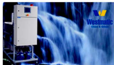
WATER TREATMENT ↻