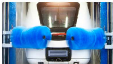
TRAIN WASH ↻