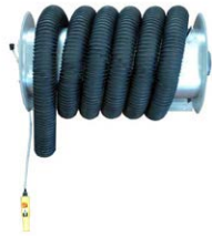
FIXED HOSE REELS