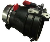
HD NOZZLES WITH GRIPPER