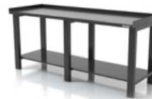
HEAVY DUTY WORKBENCHES